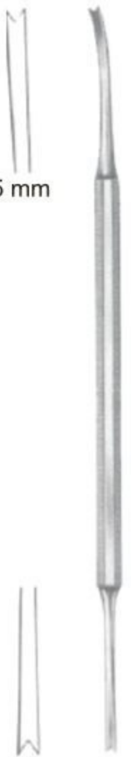
Luniatschek 20-5351-18 18 cm/7"