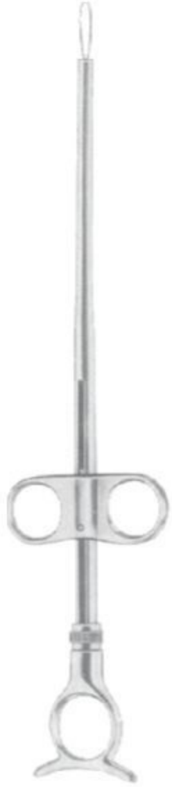
Eves 20-5389-28 28 cm/11"