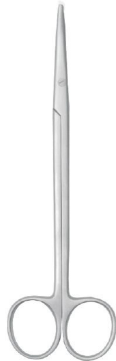
Metzenbaum Scissor Cvd. 20-5404-18 18cm/7"