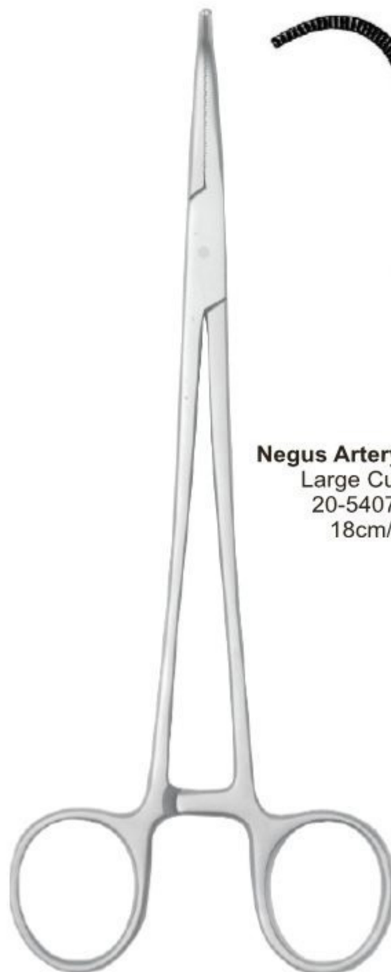
Negus Artery Forcep Large Curved 20-5407-18 18cm/7"