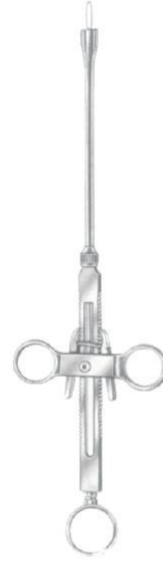
Bruenings 20-5391-28 28 cm/11"