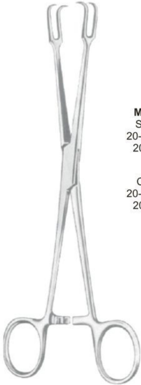
Museux Straight 20-5381-20 20 cm/8"

Tonsil Seizing Forceps ● EN Tonsillenzangen ● DE Pinzas para coger las amígdalas ● ES