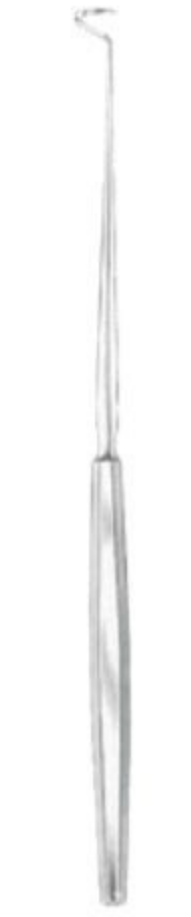
Hurd 20-5355-24 24 cm/9½"