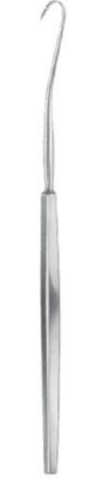
Claus 20-5354-23 23 cm/9"