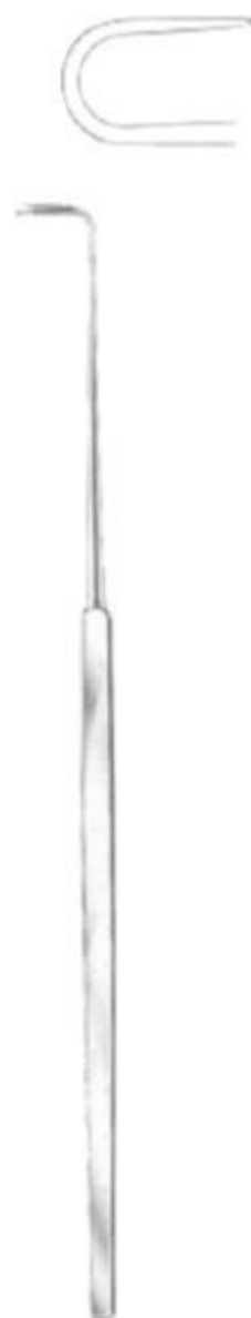
Falk 20-5358-24 24 cm/9½"