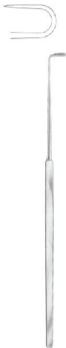
Falk 20-5359-24 24 cm/9½"