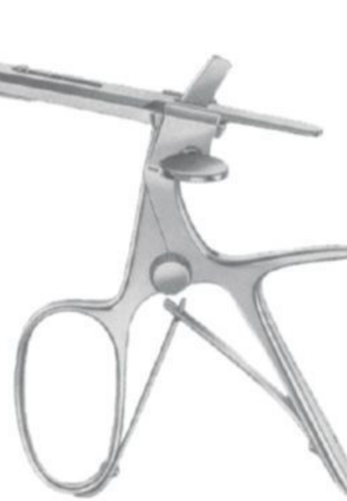
Sluder-Ballenger Complete, With 3 Tips 20-5394-00