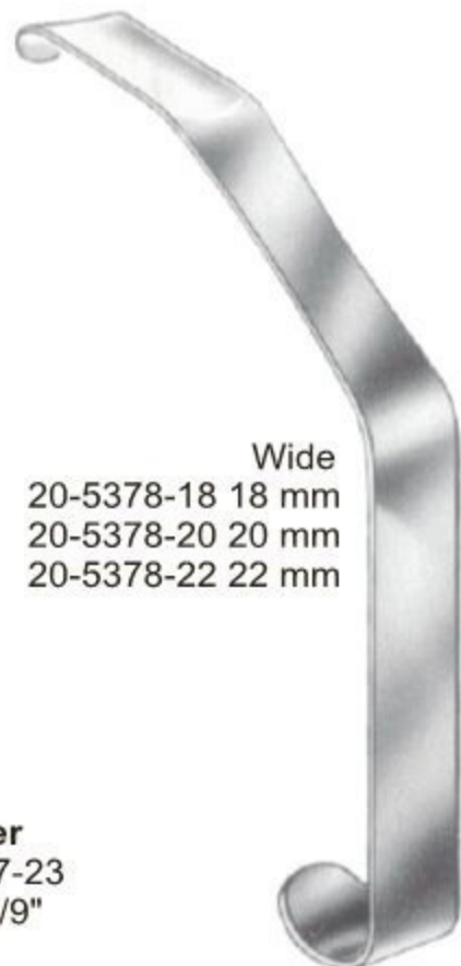
Wide 20-5378-18 18 mm 20-5378-20 20 mm 20-5378-22 22 mm