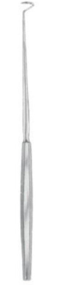
Hurd 20-5356-21 21 cm/8¼"