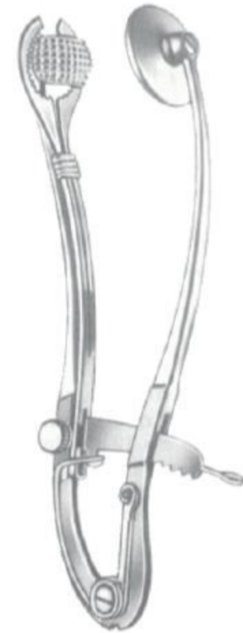
Corwin 20-5395-14 14 cm/5½"