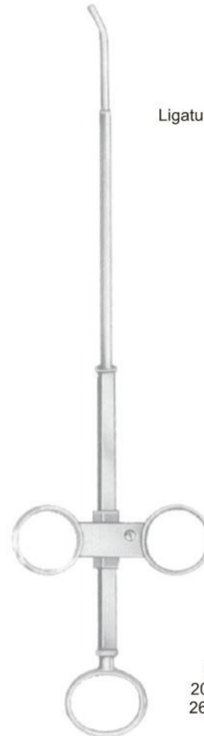
Roeder 20-5361-26 26 cm/10¼"