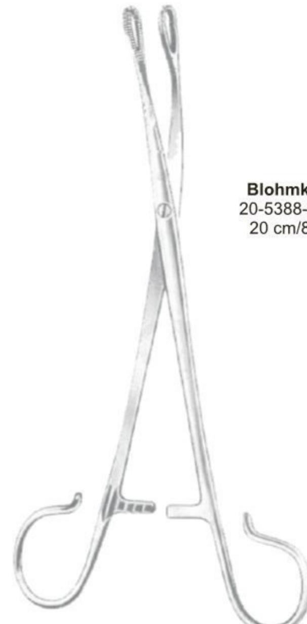
Blohmke 20-5388-20 20 cm/8"