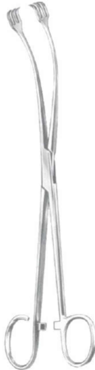
Ballenger 20-5383-21 21.5 cm/8½"