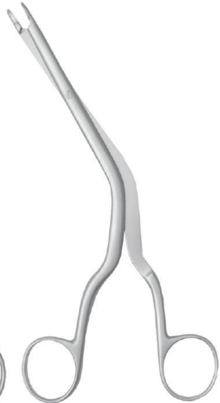
Luc Forceps 20-5398-20 Small 20-5399-20 Medium 20-5400-20 Large 20cm/8"