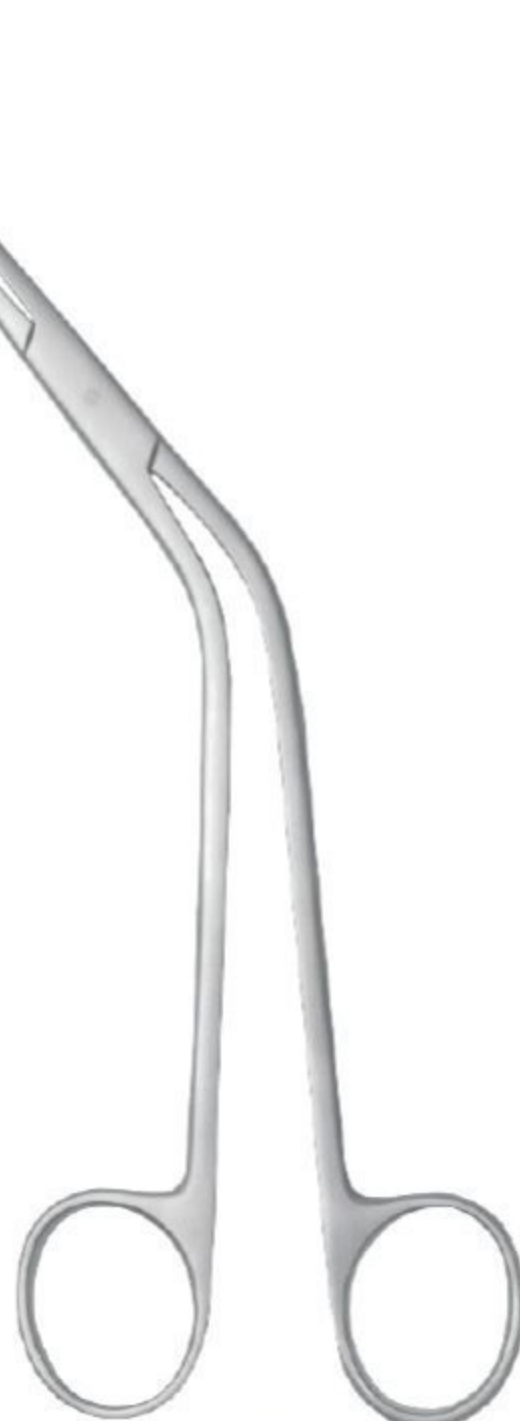
Denis Browne Tonsil Forceps 20-5397-20 20cm/8"