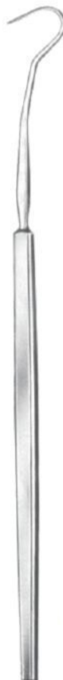
Claus-Eicken 20-5360-23 23 cm/9"