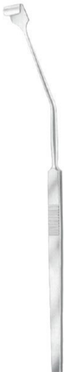
Nager 20-5377-23 23 cm/9"