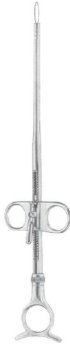
Eves 20-5390-28 28 cm/11"