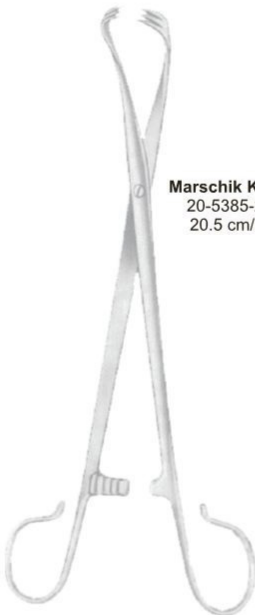
Marschik Kroni 20-5385-20 20.5 cm/8"