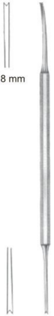
Luniatschek 20-5352-18 18 cm/7"