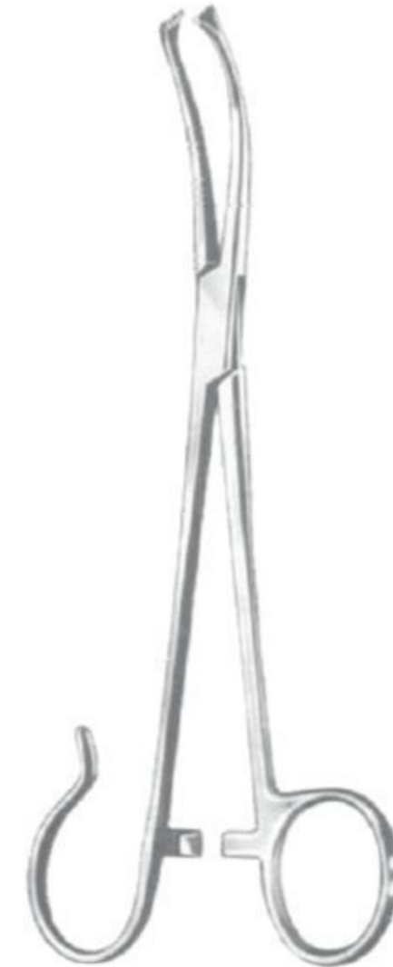
White 20-5384-18 18 cm/7" 20-5384-23 23 cm/9"