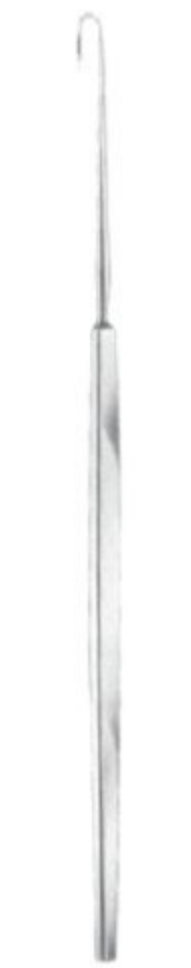
Trelat 20-5353-23 23 cm/9"